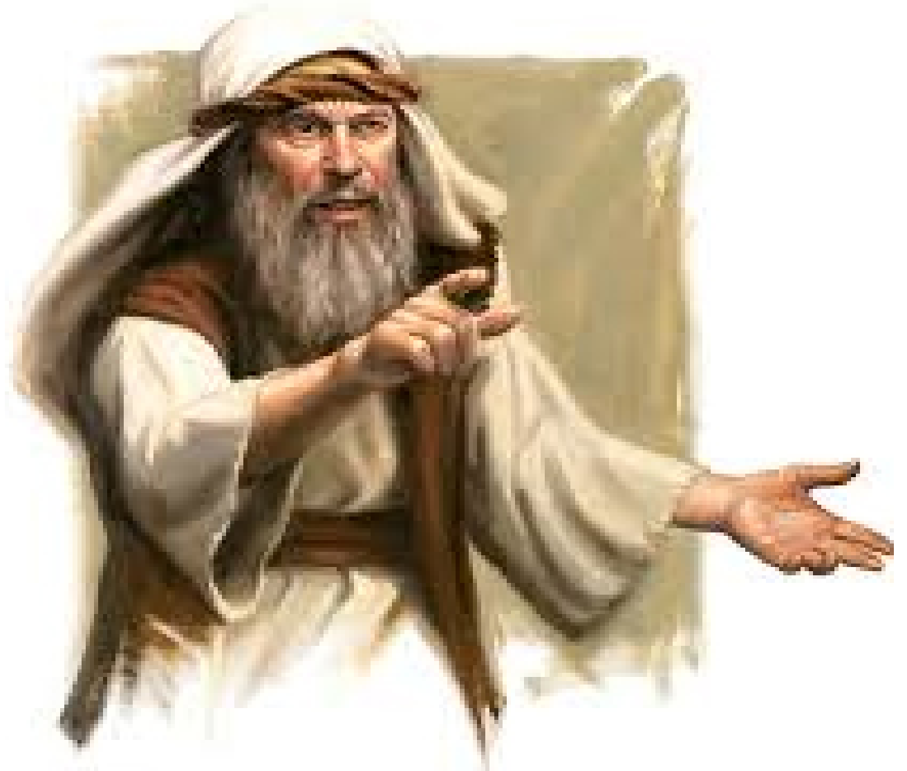
Nahum, the Prophet 7th century BC.

Well, two thousand six hundred years ago, Nahum the prophet described it this way: He said: